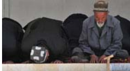
Eight major world religions meet up in a book