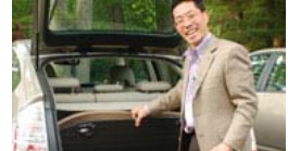
Fighting for 'made in the USA'