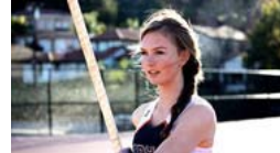
Young athlete transcends the rules