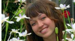
Gruesome death photos are at the forefront of an Internet privacy battle