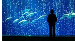
Audio slideshow: Monterey Bay Aquarium turns 25