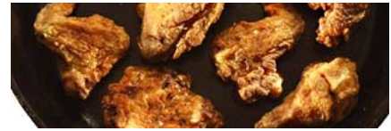
How to make simple yet perfect fried chicken at home. More recipes