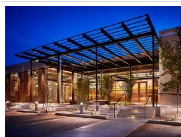
Night time outside LIVESTRONG Headquarters at 2201 E. 6th Street, Austin, TX