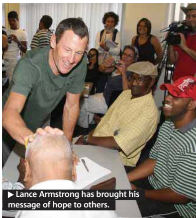
▶ Lance Armstrong has brought his message of hope to others.

Cancer touches every life on earth. It is projected to be the leading cause of death worldwide this year, claiming more of us than AIDS, tuberculosis and malaria combined. Twenty-eight million people struggle with it and if current trends continue, the number of new cases could triple by 2030. But in many parts of the world, we don't