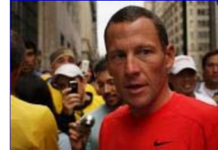
Lance Armstrong has pledged $250,000 for victims of the Haiti earthquake