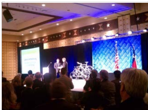
Lance Armstrong named Austinite of the Year for 2010 by the Austin Chamber of Commerce.