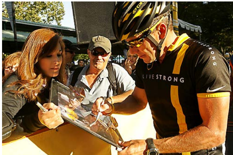
Lance Armstrong signs a framed photograph for a fan prior to the start of the Livestrong Challenge ride in Davis Sunday morning. To view galleries and purchase prints of Livestrong Challenge photos, visit http://davisenterprise.zenfolio.com.

They came from 36 states and nine countries to ride their bikes through Davis and raise money for cancer research, prevention and survivor assistance.