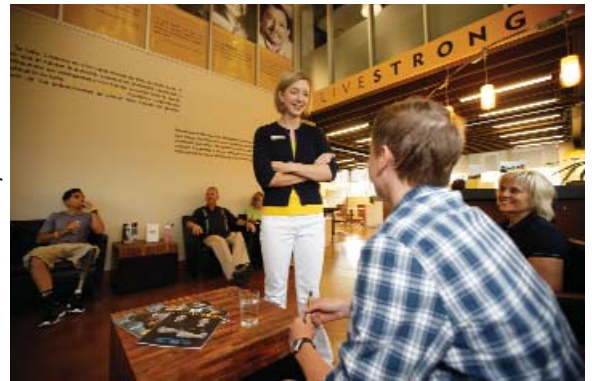
LIVESTRONG provides practical, timely support to individuals affected by cancer.

The Navigation Center, which sits adjacent to the Foundation's headquarters at 2201 E. Sixth St., is staffed by LIVESTRONG personnel, including intake specialists, a licensed professional counselor, and a licensed master social