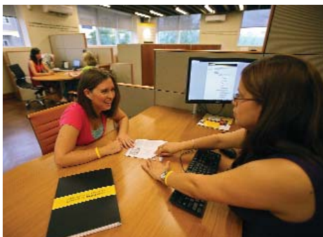
The center provides free, confidential, one-on-one, in-person support in English and Spanish to anyone affected by cancer.

As of this fall, Travis County is home to a first-of-its-kind resource center that can address these questions and much more. Located in East Austin, the LIVESTRONG Cancer Navigation Center helps people find their way when cancer threatens to derail their lives. The Center provides free, confidential, one-on-one, in-person support in