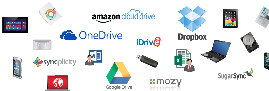
Every month, there is an increase in the number of places where your exported SAP data can be saved.

How does a company ensure that data leaving applications is correctly classified and protected from unauthorized access?